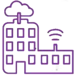
Construction & Infra