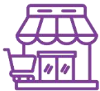
Fashion and Retail